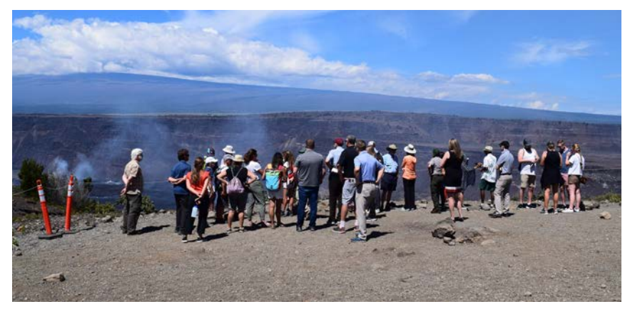
During the workshop, participants got a chance to visit Volcanoes National Park, where the power of geothermal was on full display.

"[Geothermal energy] can drive our negative emission goals by helping to power direct air capture or some of these other really innovative, cutting-edge technologies that are very expensive right now," Glenn said. "The low, low price that geothermal can offer, makes them much more viable and puts them on the table."