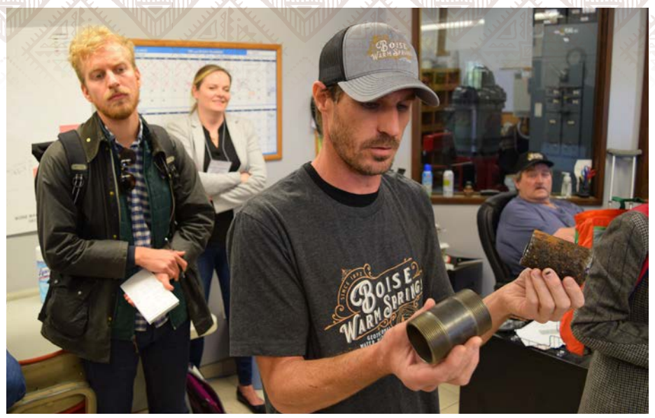
At Boise's Warm Springs Water District production wells, system operators demonstrate the importance of materials selection when designing district heating systems. Despite high corrosion rates, Boise has successfully avoided system failures by implementing engineering and technological advancements.