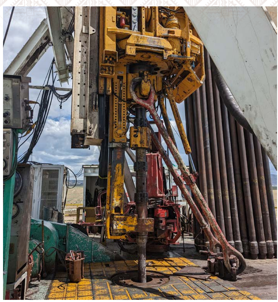
The drill at Utah FORGE, which is currently drilling a 10,000-foot-deep geothermal well to test Enhanced Geothermal Systems.

Hydrogen Production: Utilizing geothermal electricity production to power electrolysis of water to produce hydrogen createss "green hydrogen," a renewable, clean fuel source with little to no carbon footprint at the point of production. Operating electrolyzers