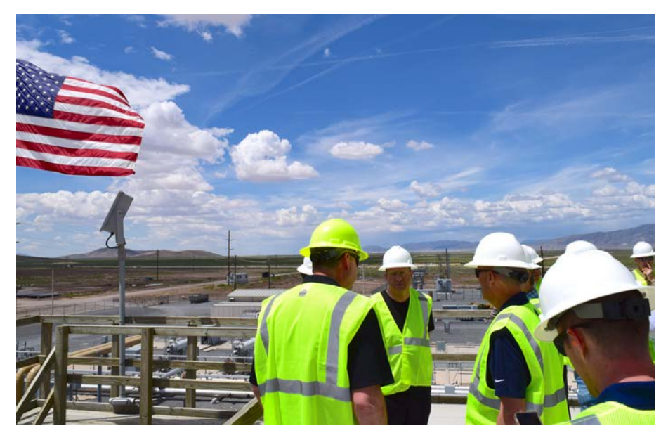
Governors Jared Polis and Spencer Cox with join the team from Cyrq Energy at its Thermo Geothermal Power Plant in Utah.

The high risk and high upfront cost of geothermal development resulting from uncertainty in the viability of resources is a significant barrier to the industry's growth. To offset some of the risk and encourage investment, DOE offered several programs from