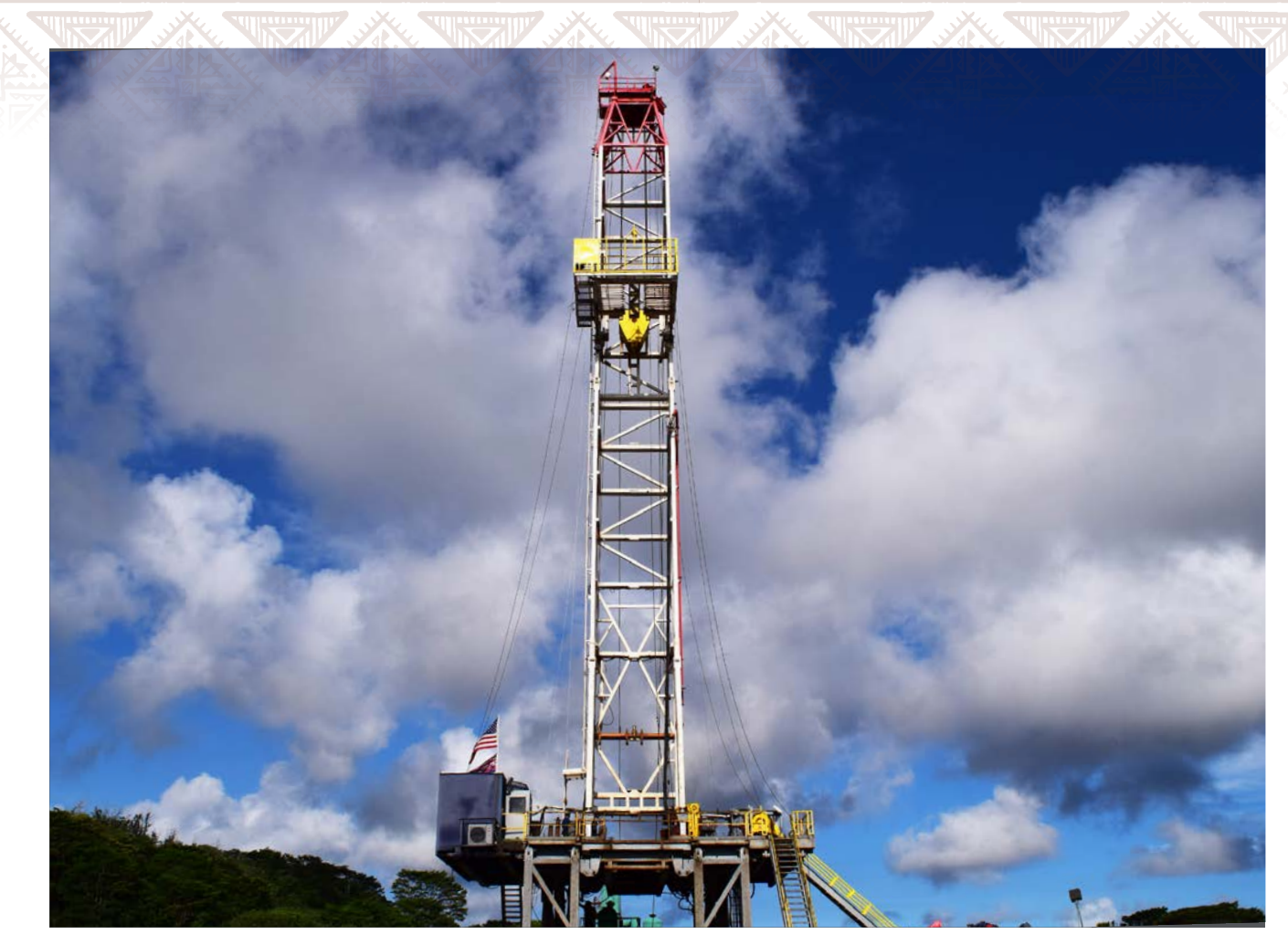
Preparing for drilling at the Puna Geothermal Venture, operated by Ormat Technologies Inc. The exploration and drilling phases often bring the highest risk for failure and the most cost to geothermal development.

costs of heating and cooling with geothermal are far more consistent. By harnessing the steady temperature of the Earth, geothermal systems can displace most of the energy needed to heat and cool buildings.