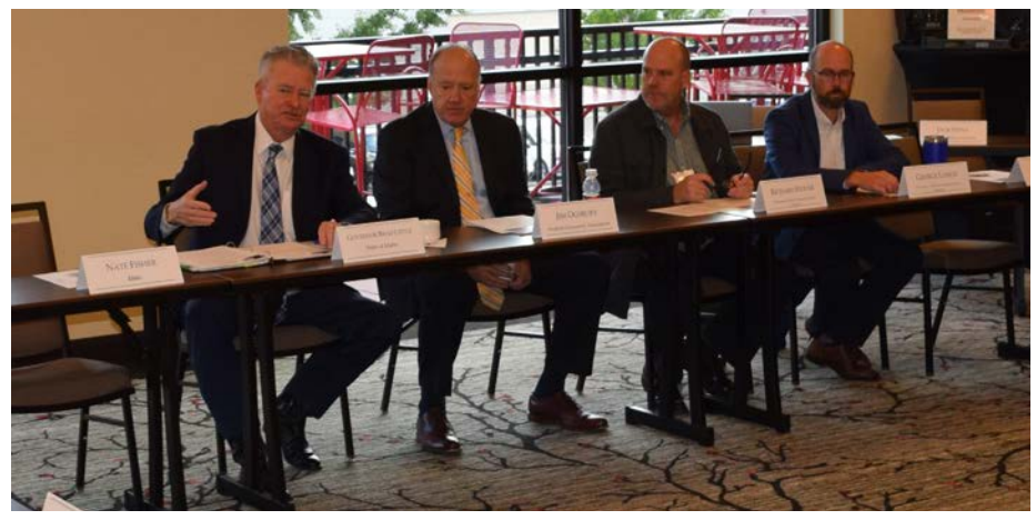
Idaho Governor Brad Little discussed the benefits the city has reaped as a result of Boise's use of its geothermal resources.

for geothermal.' Those are hidden resources that our estimates suggest are three-quarters or more than our current resources."