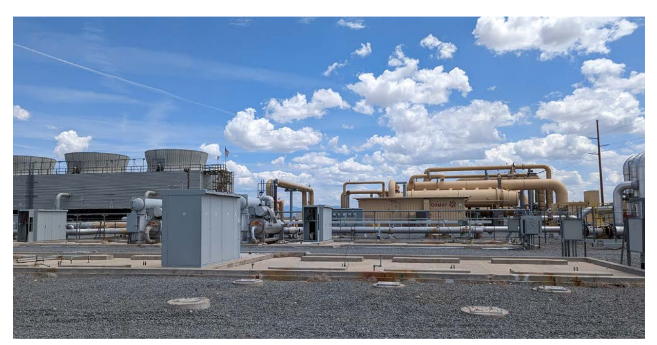
Cyrq Energy's Thermo Geothermal Power Plant, which sustainably produces power used in Anaheim, California.

In 2008, BLM and USFS released the Final Programmatic Environmental Impact Statement for Geothermal Leasing in the Western United States to facilitate decisions on geothermal lease applications. This remains an effective tool to help the agencies process lease nominations. As a next step, BLM should establish priority leasing areas for geothermal energy, as it has done for wind and solar energy in Instruction Memorandum No. 2022-027. Priority leasing areas should shorten development timelines for projects with the greatest technical and financial feasibility and the least anticipated natural and cultural resource conflicts on BLM-administered lands.