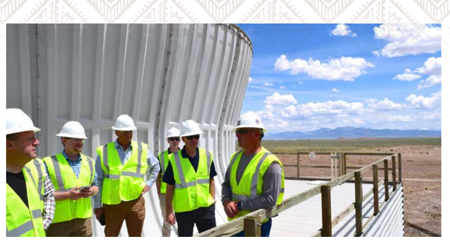
Governor Jared Polis and Governor Spencer Cox get an up-close tour of Cyrq Energy's Thermo Geothermal Power Plant in Utah.

Situated within the Basin and Range Province, Utah provides immense potential for not just conventional hydrothermal systems, but also EGS and other innovative technologies. Rapid and innovative development has been bolstered by supportive state policies and initiatives. In the early 2000s, the state established a Utah Geothermal Working Group to facilitate collaboration between industry stakeholders, regulators, and local communities, fostering a supportive environment