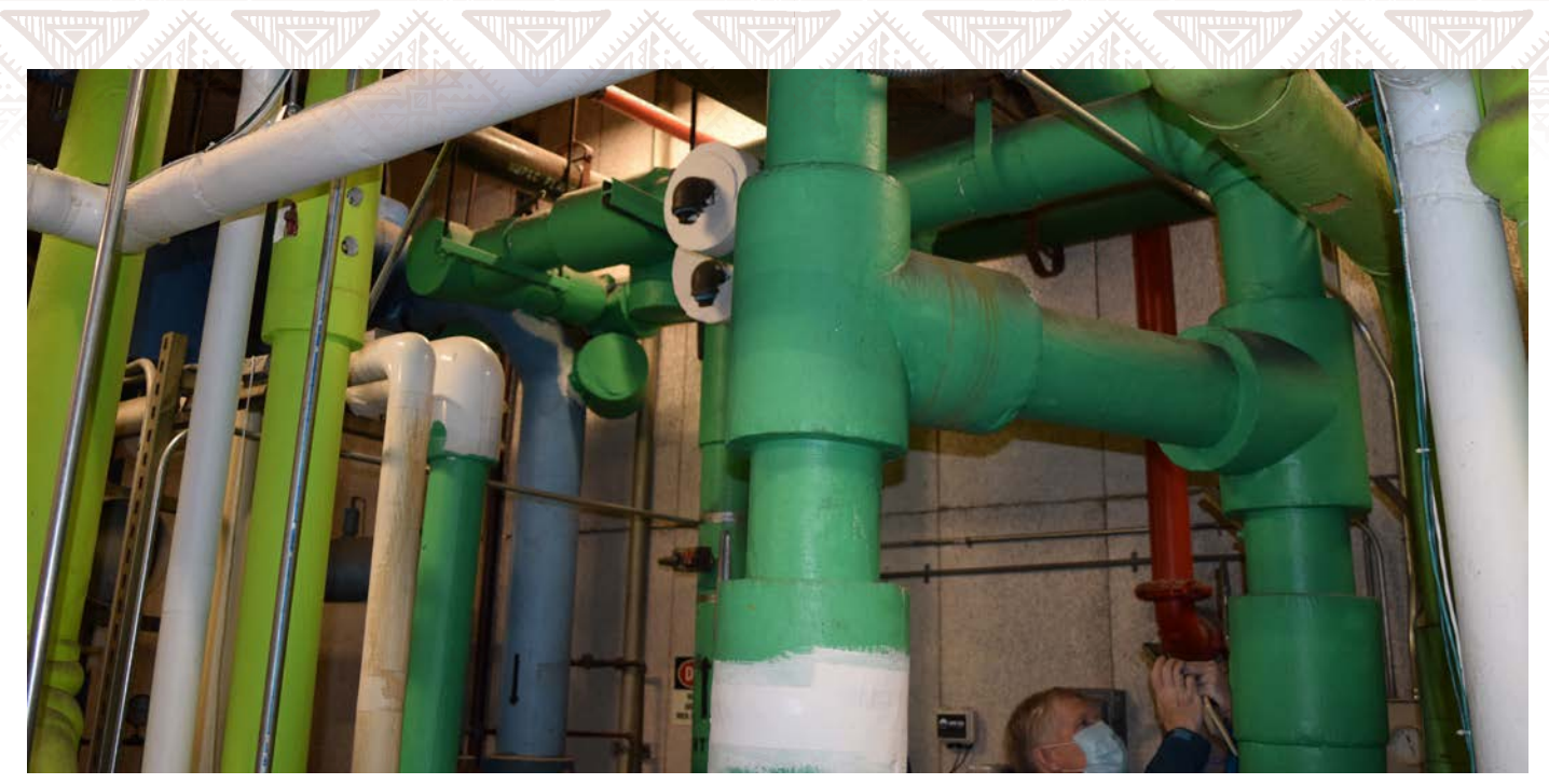
Beneath Boise's City Hall lies an intricate network of pipes that act as a heat exchanger for the city's geothermal district heating systems. Idaho workshop participants toured the mechanical room at City Hall to view the infrastructure.

The initiative examined the various market, technology, and policy factors that affect the development of geothermal resources. Through a rigorous stakeholder process that included four workshops, six tours, a public survey, and a webinar series, the Heat Beneath Our Feet initiative generated recommendations for increasing the development and deployment of geothermal energy in the West, including: